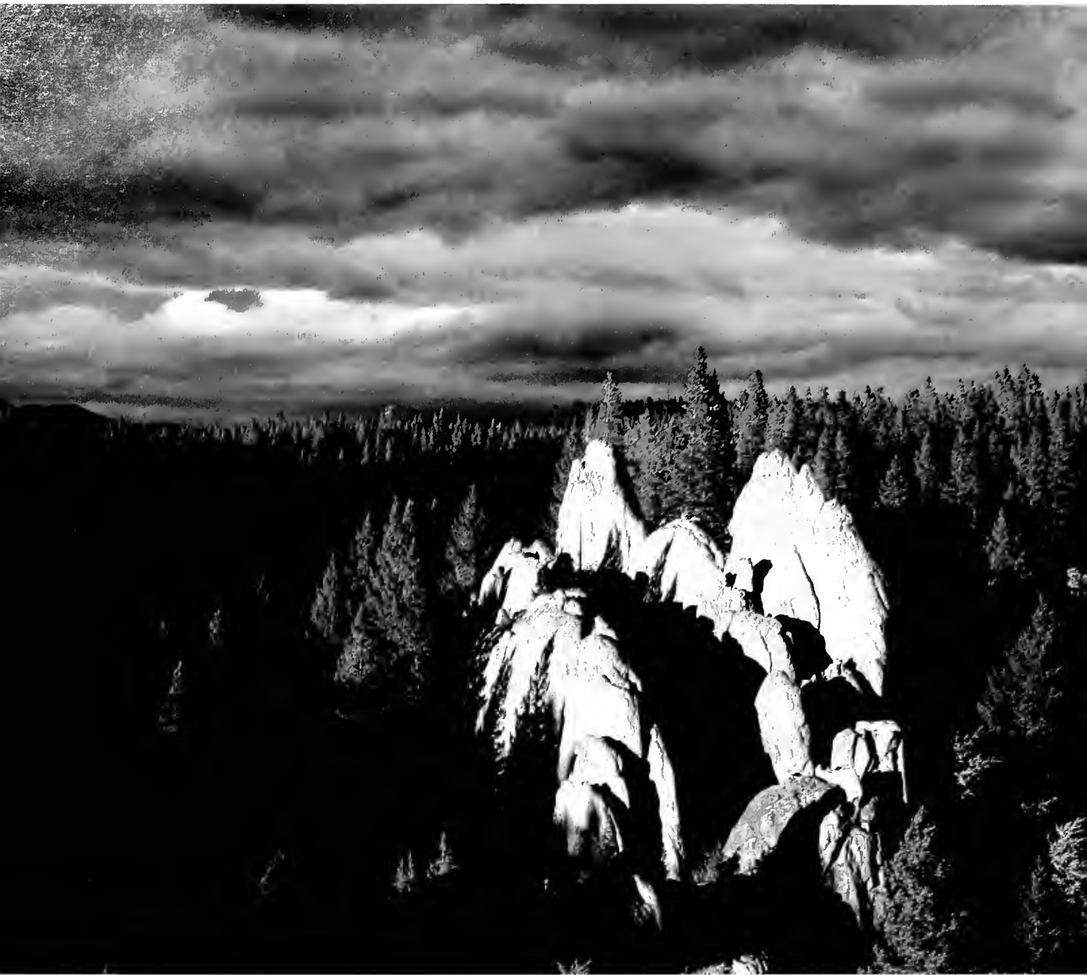
Homestake Pass